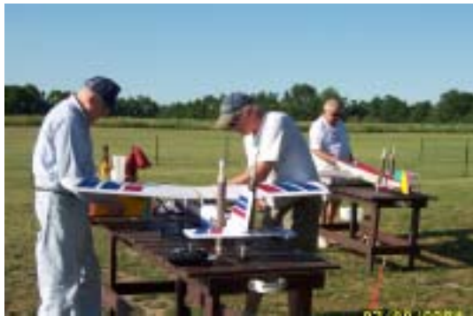
The CHIEFS' Field

Flying an airplane or helicopter while your feet are planted firmly on the ground is the ultimate goal of this hobby. Learning how to do that, and doing it, in a safe sensible way, at an airfield created exclusively for that purpose is what our club is all about. The wealth of knowledge and experience that is so generously shared among members makes being a member and participating in club events a privilege.